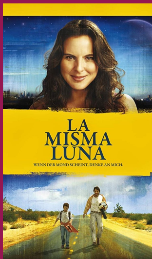
La Misma Luna (Elementary level)