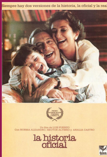
La Historia Oficial (Intermediate level)